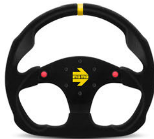
MOD. 30 WITH BUTTONS BLACK SUEDE, BLACK SPOKES. WITH BUTTONS - Ø 320 mm