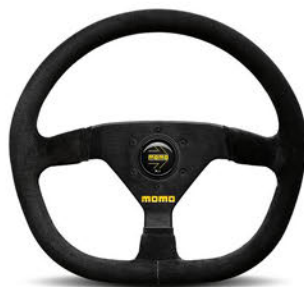
MOD. 88 BLACK SUEDE, BLACK SPOKES. Ø 320 mm / Ø 350 mm