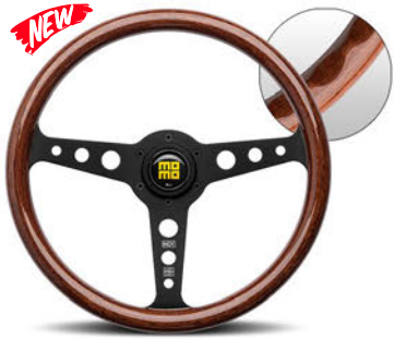
INDY HERITAGE MAHOGANY WOOD ZEBRANO GLOSSY FINISHING, BACK FINGER GROOVES, BLACK SPOKE - Ø 350 mm

WITH OVER 50 YEARS OF EXPERIENCE PRODUCING PERFORMANCE ACCESSORIES, MOMO GOES BACK TO THEIR ROOTS WITH THE HERITAGE LINE. WITH RETRO-INSPIRED DESIGNS AND EXCEPTIONAL QUALITY, THE HERITAGE LINE CONNECTS MOMO'S PAST WITH TODAY'S INNOVATIONS TO PRODUCE A STATE-OF-THE-ART PRODUCT FOR YOUR CLASSIC SPORTS CAR.