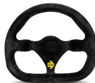
MOD. 27 BLACK SUEDE, BLACK SPOKES. Ø 270 mm / Ø 290 mm