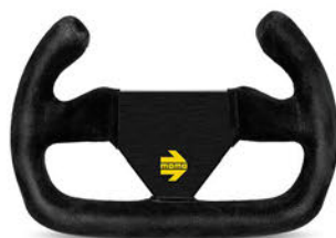
MOD. 12/C BLACK SUEDE, BLACK SPOKES. Ø 250 mm