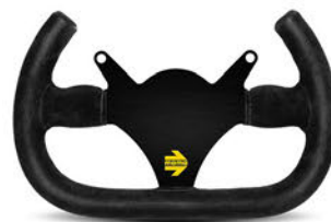
MOD. 101 BLACK SUEDE, BLACK SPOKES. Ø 290 mm