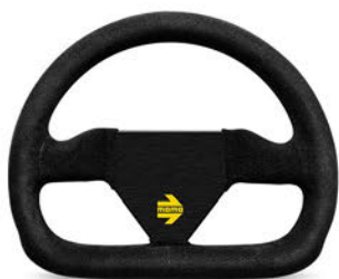
MOD. 12 BLACK SUEDE, BLACK SPOKES. Ø 250 mm / Ø 260 mm