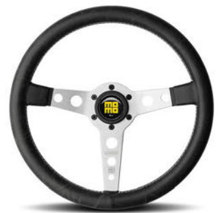
PROTOTIPO HERITAGE DISTRESSED BLACK LEATHER, WHITE STITCHES, SILVER SPOKE - Ø 350 mm