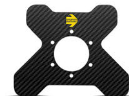
CARBON PLATE 4 GENUINE CARBON FIBER, ALLOWS UP TO 4 BUTTONS (NOT INCLUDED), 6 DRILL POINTS STANDARD HUB ATTACHMENT.

NFC ALL OUR STEERING WHEELS ARE EQUIPPED WITH THE EXCLUSIVE NFC TECHNOLOGY. CONTACT THE CLOSEST DEALER FOR MORE INFO.