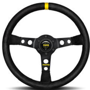
MOD. 07 BLACK SUEDE OR BLACK LEATHER, BLACK SPOKES - Ø 350 mm