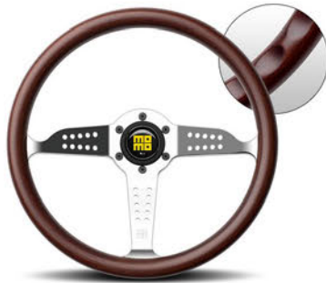
SUPER GRAND PRIX MAHOGANY WOOD WALNUT MATT FINISHING, BACK FINGER GROOVES, CHROME FINISH SPOKE - Ø 350 mm