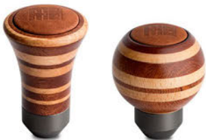
TROFEO MAHOGANY AND BEECHWOOD WOOD, EMBOSSED VINTAGE CIGAR LEATHER TOP, TWO DIFFERENT SHIFT KNOBS SHAPES TO MEET EVERY DRIVERS' NEED.