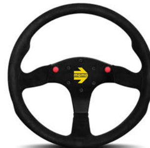
MOD. 80 BLACK SUEDE OR BLACK LEATHER, BLACK SPOKES, WITH BUTTONS - Ø 350 mm