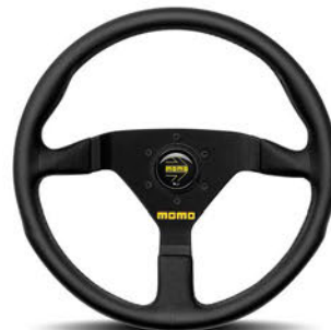
MOD. 78 BLACK SUEDE OR BLACK LEATHER, BLACK SPOKES - Ø 350 mm / Ø 320 mm