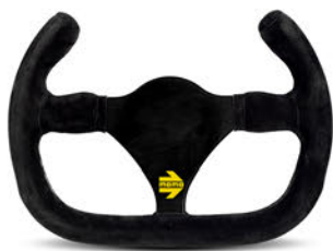
MOD. 27/C BLACK SUEDE, BLACK SPOKES. Ø 270 mm