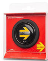
HORN BUTTONS ONE OF MOMO'S MOST ICONIC ELEMENTS DESERVES A SPECIAL PACKAGING: AN ELEGANT TRANSPARENT LITTLE BOX CONTAINS OUR RANGE OF STEERING WHEELS' HORN BUTTONS.