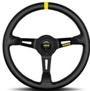
MOD. 08 BLACK SUEDE OR BLACK LEATHER, BLUE SPOKES - Ø 350 mm