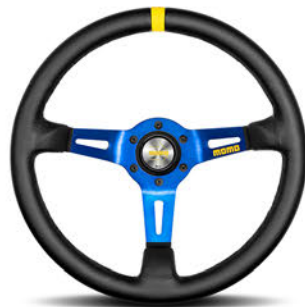
MOD. 08 BLACK SUEDE OR BLACK LEATHER, BLACK SPOKES - Ø 350 mm