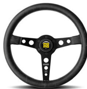
PROTOTIPO HERITAGE DISTRESSED BLACK LEATHER, WHITE STITCHES, BLACK SPOKE - Ø 350 mm