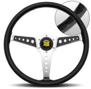
CALIFORNIA BLACK LEATHER WITH PARALLEL WHITE STITCHES, BACK FINGER GROOVES, CHROME FINISH SPOKE - Ø 360 mm