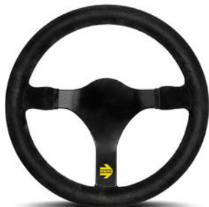
MOD. 31 BLACK SUEDE, BLACK SPOKES. Ø 320 mm / Ø 340 mm