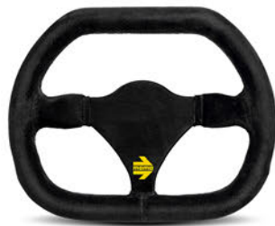
MOD. 29 BLACK SUEDE, BLACK SPOKES. Ø 270 mm