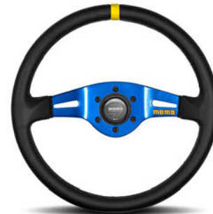
MOD. 03 BLACK SUEDE OR BLACK LEATHER, BLUE SPOKES - Ø 350 mm