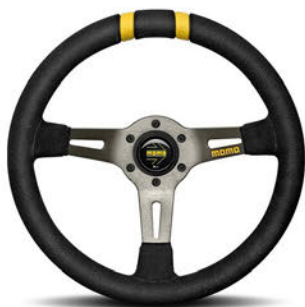
DRIFTING BLACK SUEDE, ANTHRACITE SPOKES, YELLOW LEATHER MARKERS ON THE TOP. Ø 330 mm