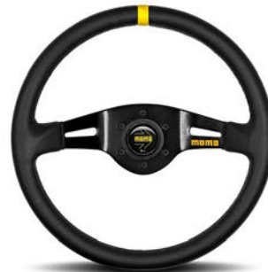
MOD. 03 BLACK SUEDE OR BLACK LEATHER, BLACK SPOKES - Ø 350 mm