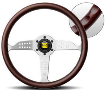
GRAND PRIX MAHOGANY WOOD WALNUT MATT FINISHING, BACK FINGER GROOVES, SILVER SPOKE - Ø 350 mm