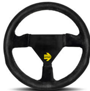
MOD. 11 BLACK SUEDE, BLACK SPOKES. Ø 260 mm / Ø 280 mm