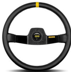
MOD. 02 BLACK SUEDE OR BLACK LEATHER, BLACK SPOKES - Ø 350 mm