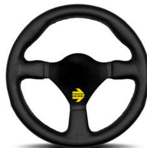
MOD. 26 BLACK SUEDE, BLACK SPOKES. Ø 260 mm / Ø 280 mm / Ø 290 mm