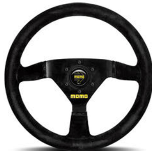
MOD. 69 BLACK SUEDE, BLACK SPOKES. Ø 350 mm