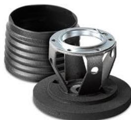
INSTALLATION HUB CHECK OUR APPLICATION LIST TO VERIFY YOUR VEHICLE'S HUB REQUIREMENT.