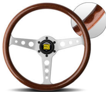
INDY HERITAGE MAHOGANY WOOD ZEBRANO GLOSSY FINISHING, BACK FINGER GROOVES, SILVER SPOKE - Ø 350 mm