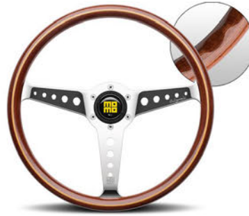
CALIFORNIA WOOD MAHOGANY WOOD ZEBRANO GLOSSY FINISHING, BACK FINGER GROOVES, CHROME FINISH SPOKE - Ø 360 mm