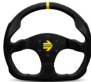
MOD. 30 BLACK SUEDE, BLACK SPOKES. Ø 320 mm